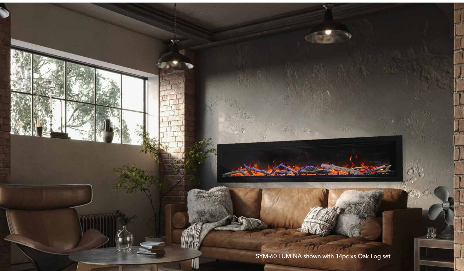
SYM-60 LUMINA shown with 14pc xs Oak Log set

The Symmetry Lumina Electric Fireplace – where innovation meets ambiance and convenience in one stunning package. Elevate your home's atmosphere with the mesmerizing dance of vibrant flames, now available in three captivating colors.