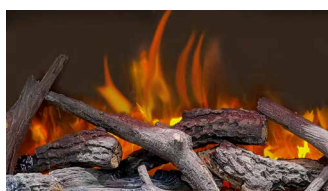
Oak Log set