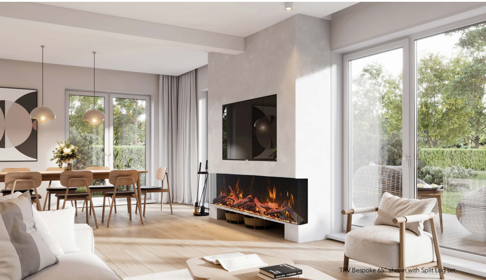
TRV Bespoke 65" shown with Split Log set.

The Tru View Bespoke is the ultimate in electric fires, offering a versatile design that can be installed in a multitude of ways; connect multiple units to make a bold statement. Unlike other fireplaces, the Tru View Bespoke features customizable installation and connectable units for a grand masterpiece.